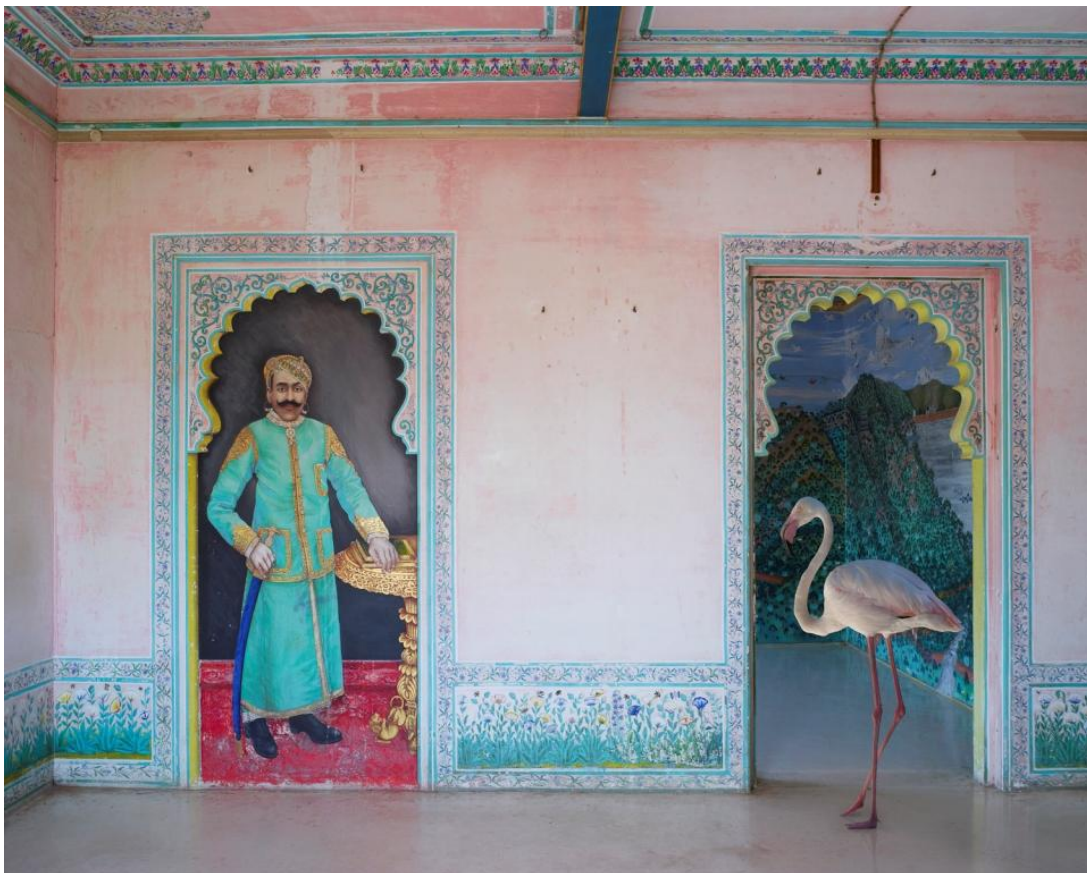
End Of The Hunt, Bara Mahal. Udaipur, Karen Knorr, 2013

Karen Knorr is an American photographer whose series India Song digitally inserts animals and birds inside elaborate buildings and rooms. Each image in this series has a title, and many of them are inspired by the legends and folklore of India itself! This one, for example, is called The End Of The Hunt .